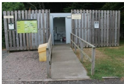
Disabled accessible WC, Etal village

Etal Village has public toilets in the car park adjacent to Etal Castle. There is one gents, one ladies and one unisex disabled-accessible cubicle, the latter being wheelchair accessible via a concrete ramp from the car park. The door is 90 cm wide with a horizontal hand rail on the inside. There are two vertical rails fixed to the wall either side of the hand basin and one vertical rail to the left of the toilet, as well as a moving, double handrail 16cm to the left of the toilet, rail height 55cm bottom and 73cm top. The hand basin is 74cm high and has a cold tap and hot 'touch free' tap. The toilet seat is 47 cm high. There is no alarm call system. There are baby changing facilities (wall mounted fold-down table) in the disabled-accessible cubicle.