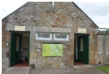
WC entrances at Heatherslaw

Heatherslaw (adjacent to Visitor Centre) has gents and ladies WC facilities (each with two cubicles) accessed from the road where there is a dropped kerb onto the concrete path. There is one cubicle in each of the gents and ladies WCs with disabled accessible. Wheelchair users can access the WCs with assistance. The door width is 87 cm; toilet seat height 43 cm washbasin height 89 cm. Each disabled cubicle has one horizontal support rail beside the toilet, at 93 cm high. The ladies disabled cubicle has a fold down baby-changing table.