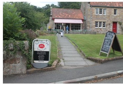
Entrance path to Ford Shop

There is one small WC for use by patrons of the tearoom. This is not disabled accessible. The Sub-Post Office is open Monday-Friday 0830-1230. There is a defibrillator on the outside wall of the shop.