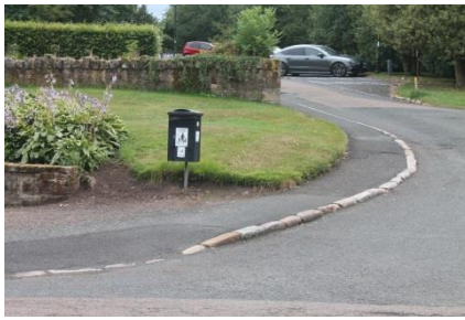
Dropped kerb – main street below Ford Shop