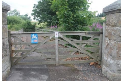
Entrance to Route 68 cycle way/footpath from Heatherslaw to Etal

Route 68 Berwick-Derby national cycle route passes through the Estate and there is a dedicated, off-road section running from Tindal House to Etal Village (approx 2 miles, some hills) and from Slainsfield road end to Heatherslaw (approx ½ mile, level). These paths are used by walkers and cyclists and are accessible to wheelchair users.