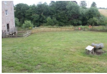
The Paddock at Heatherslaw