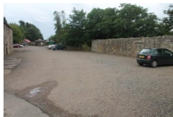
Ticket Office/level entry to station platform Car Park Heatherslaw Light Railway