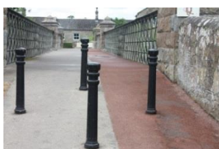
Bridge leading to Heatherslaw Cornmill

There are two car parks with deep gravel on the east side of the river, accessed from the B6354: one at Heatherslaw Railway (flat surface with parking adjacent to ticket office), and one adjacent to the railway car park (flat surface with 15 parking spaces). The iron bridge leading across to the Mill and Visitor Centre from the car parks is for pedestrian and bicycle use only.