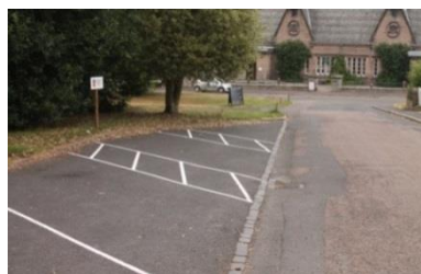
Car parking in Ford

Car parking is free throughout the Estates and is accessible to the disabled, with designated disabled parking spaces at certain locations (see below for details).