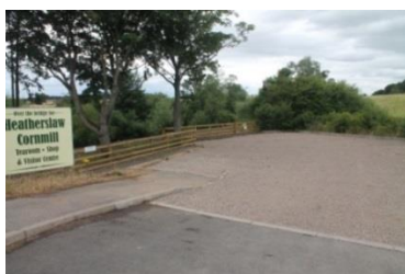
Car park east of river, Heatherslaw