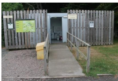
Disabled accessible WC, Etal village

Etal Village has public toilets in the car park adjacent to Etal Castle. There is one gents, one ladies and one unisex disabled-accessible cubicle, the latter being wheelchair accessible via a concrete ramp from the car park. The door is 90 cm wide with a horizontal hand rail on the inside. There are two vertical rails fixed to the wall either side of the hand basin and one vertical rail to the left of the toilet, as well as a moving, double handrail 16cm to the left of the toilet, rail height 55cm bottom and 73cm top. The hand basin is 74cm high and has a cold tap and hot 'touch free' tap. The toilet seat is 47 cm high. There is no alarm call system. There are baby changing facilities (wall mounted fold-down table) in the disabled-accessible cubicle.