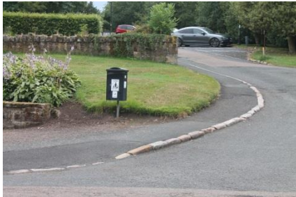
Dropped kerb – main street below Ford Shop

There is one step into the shop area and a further two steps into the Tearoom. A ramp to access the shop is available on request. Refreshments are served inside and outside on the patio where there are tables and chairs. Access from the road is via a flagstone path which joins the village footpath. There is a dropped kerb from the road below the shop.