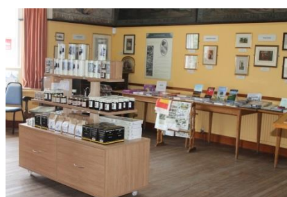
Retail area, Lady Waterford Hall

The Hall has a small retail area selling a range of gifts, cards, souvenirs, biscuits etc. There are a range of pamphlets and books about Louisa Waterford/her artwork. The Hall is also available for private hire – contact ladywaterfordhall@gmail.com or telephone 07971 326177.