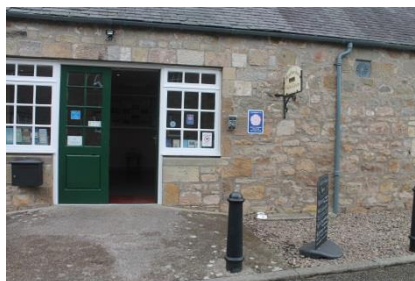
Entrance to the Visitor Centre

At ground floor level, the Centre is fully accessible with a double door opening to 140cm allowing wheelchair access. A ten-minute, sub-titled, audio-visual presentation about Ford & Etal Estates runs on a continuous loop. For visitors unable to access the Cornmill there is also a short film about the Mill which is available on request. Interpretation boards are mounted half way up the walls. A range of leaflets describing walks and cycle routes around the Estates and things to do in the local area are available. Visitors who are unable to access the Tearoom can be served in the Visitor Centre – table(s) and chairs are available.