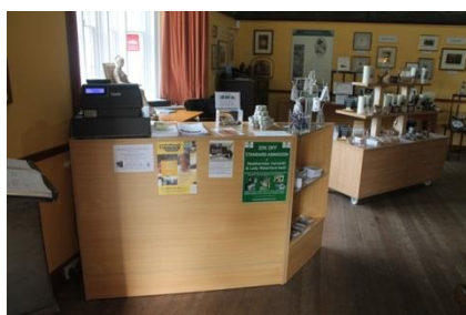
Ticket counter, Lady Waterford Hall

There is no hearing loop in the Hall. Interpretation panels are fixed on the wall at standing eye level; there are sloping panels in the centre of the Hall 110cm high. There is an audio-visual presentation about the history of Ford and Lady Waterford which is shown on request. This is not sub-titled. The floor in the main hall is wooden boards; in the ante-room it is carpet. In the toilets and linking vestibule there is a non-slip floor covering.