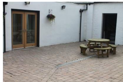
The Black Bull, Etal - rear entrance