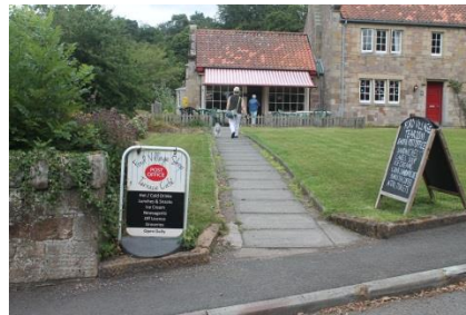
Entrance path to Ford Shop

There is one small WC for use by patrons of the tearoom. This is not disabled accessible. The Sub-Post Office is open Monday-Friday 0830-1230. There is a defibrillator on the outside wall of the shop.