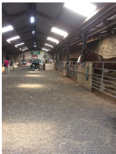
The main stable, Hay Farm

The outside picnic area adjacent to the horses' field is grassed but level, so accessible with care. The Centre buildings including the shop are wheelchair accessible, being at ground floor and/or accessed via a ramp. There is a car park within the Centre. Carry-out refreshments are available.