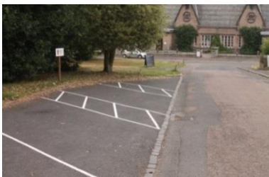
Car parking in Ford

Car parking is free throughout the Estates and is accessible to the disabled, with designated disabled parking spaces at certain locations (see below for details).