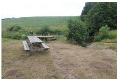
Picnic Benches by the river at Etal

Bench seats are located in Ford Village, adjacent to lay-by, opposite Lady Waterford Hall, in the play park situated on the left past The Old Forge and outside Etal Village Hall.