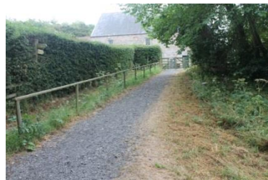
Path from Heatherslaw Railway Terminus to Etal Castle