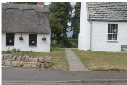
Path to rear entrance/beer garden