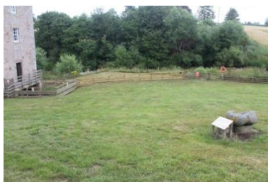
The Paddock at Heatherslaw

Grass areas in all the villages are regularly mown and available to the public as play/picnic areas - these include the paddock at Heatherslaw Mill, the area below Taylor and Green and adjacent to the river in Etal, the area outside Etal Village Hall, the areas opposite Lady Waterford Hall in Ford.