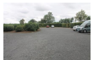
Car park adjacent Etal Castle