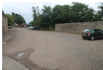
Ticket Office/level entry to station platform Car Park Heatherslaw Light Railway