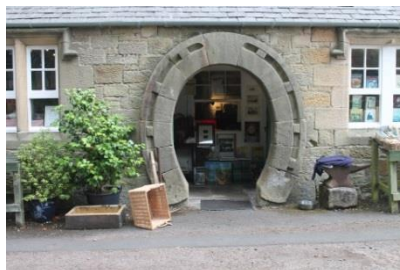
Entrance to The Old Forge

Ground floor level access from the street however space inside is very limited.