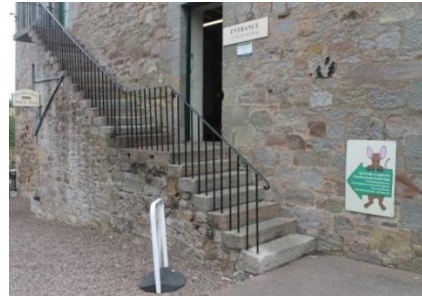
Entrance to Mill & Gift Shop