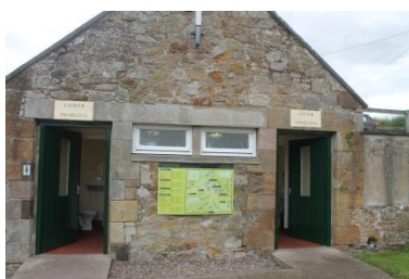
WC entrances at Heatherslaw

Heatherslaw (adjacent to Visitor Centre) has gents and ladies WC facilities (each with two cubicles) accessed from the road where there is a dropped kerb onto the concrete path. There is one cubicle in each of the gents and ladies WCs with disabled accessible. Wheelchair users can access the WCs with assistance. The door width is 87 cm; toilet seat height 43 cm washbasin height 89 cm. Each disabled cubicle has one horizontal support rail beside the toilet, at 93 cm high. The ladies disabled cubicle has a fold down baby-changing table.