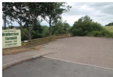
Car park east of river, Heatherslaw