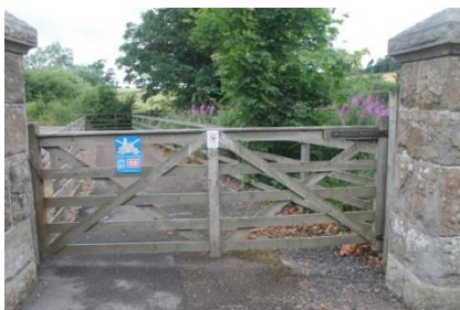
Entrance to Route 68 cycle way/footpath from Heatherslaw to Etal

Route 68 Berwick-Derby national cycle route passes through the Estate and there is a dedicated, off-road section running from Tindal House to Etal Village (approx 2 miles, some hills) and from Slainsfield road end to Heatherslaw (approx ½ mile, level). These paths are used by walkers and cyclists and are accessible to wheelchair users.