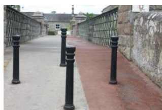
Bridge leading to Heatherslaw Cornmill

There are two car parks with deep gravel on the east side of the river, accessed from the B6354: one at Heatherslaw Railway (flat surface with parking adjacent to ticket office), and one adjacent to the railway car park (flat surface with 15 parking spaces). The iron bridge leading across to the Mill and Visitor Centre from the car parks is for pedestrian and bicycle use only.