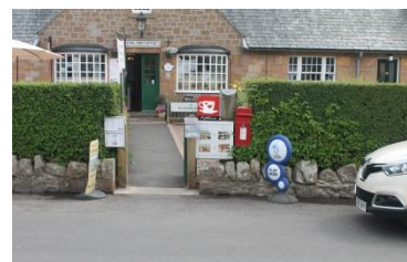
Tea Garden, Lavender Tearooms