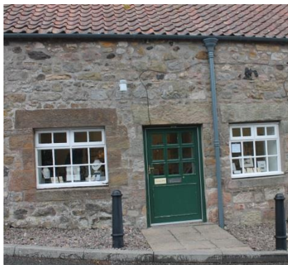
Entrance – Handmade at Heatherslaw

There is a step up from the road onto the kerb then a level entrance into the shop, doorway 90cm wide. A ramp is available on request. NB the door is very low.