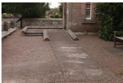
Ramped access to Lady Waterford Hall