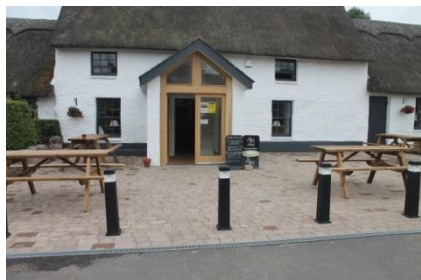
The Black Bull, Etal – front entrance

There is a designated disabled parking bay to the front of the Black Bull. There is a dropped kerb and the entrance is level, with a wide door leading into the bar area. There is a fully accessible WC in the pub's rear hall. There are two steps from the bar to the restaurant area, however the restaurant seating can be accessed from the rear of the building. A path leads from the street along the side of the pub to the beer garden and rear access.